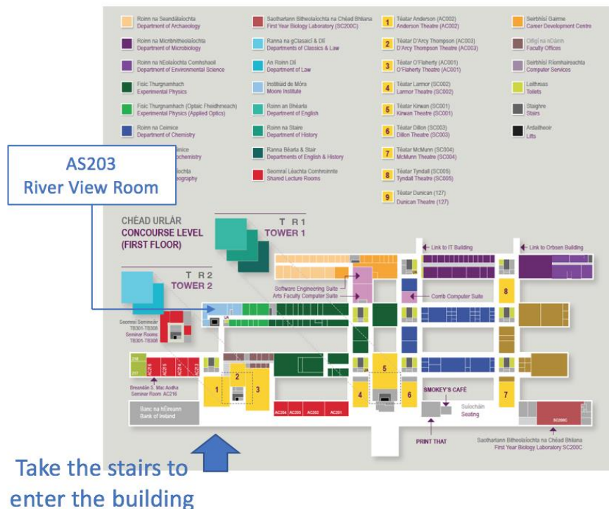
Figure 3: Location of AS203 in the river room.